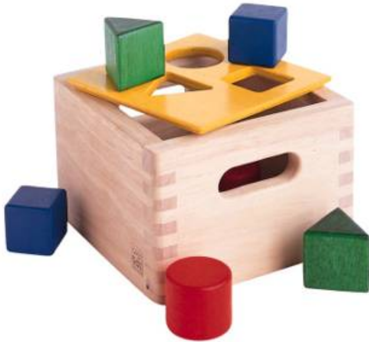
Figure 2.2: Box and blocks analogy from childhood memory: the holes on one end correspond to input templates, the holes on the other end correspond to output templates. Imagine blocks going in through one and out through the other. The blocks themselves correspond to input or output files with attached metadata . Profiles describe how one or more input blocks are transformed into output blocks, which may differ in type and number. Granted, I'm stretching the analogy here; your childhood toy did not have this magic feature of course!

Input templates are specified in part as a collection of parameters for which the user/client is expected to choose a value in the predetermined range. Output templates are specified as a collection of "metafields", which simply assign a value, unassign a value, or copy a value from an inputtemplate or from a global parameter. Through these templates, the actual metadata can be constructed. Input templates and output templates always have a label describing their function. Upon input, this provides the means for the user to recognise and select the desired input template, and upon output, it allows the user to easily recognise the type of output file. How all this is specified exactly will be demonstrated in detail later.