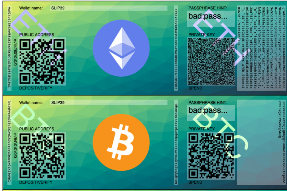
Figure 2: Paper Wallets (from --secret ffff... )

2022-10-05 17:01:05 slip39.recovery Recovered 128-bit SLIP-39 Seed Entropy with 2 (all) of 2 supplied mnemonics; Seed dec 2022-10-05 17:01:05 slip39.recovery Recovered BIP-39 secret; To re-generate SLIP-39 wallet, send it to: python3 -m slip39 ffffffffffffffffffffffffffffffff